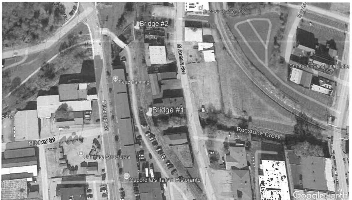
Sheepskin Trail, Bridges #1 & #2, Uniontown, Fayette County, PA