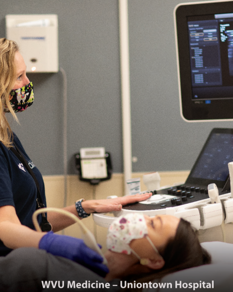
WVU Medicine – Uniontown Hospital