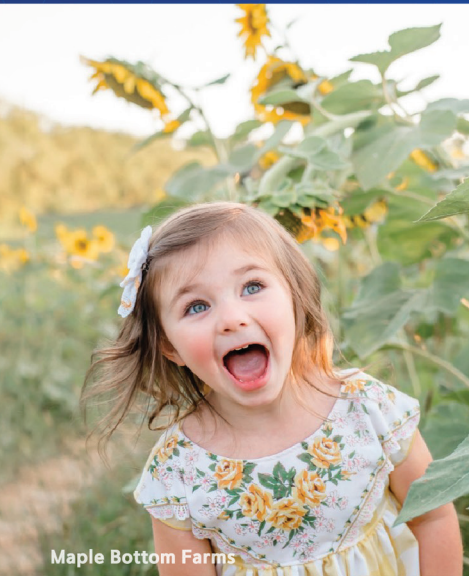
Maple Bottom Farms