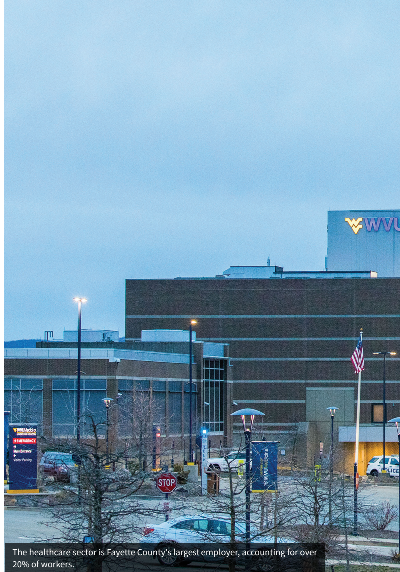
The healthcare sector is Fayette County's largest employer, accounting for over 20% of workers.