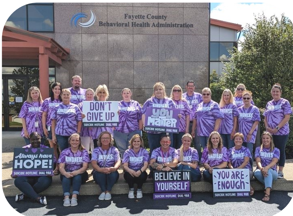
Pictured above, FCBHA staff on Tie-Out Day 2022