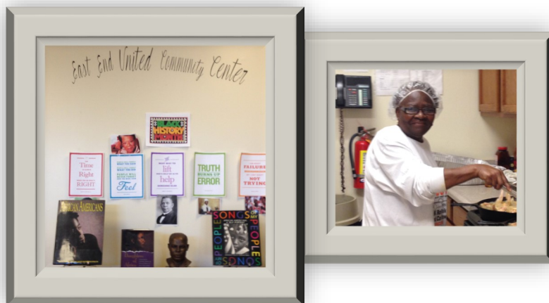
Show Above: The lobby of East End United Community Center and an amazing volunteer cooking some delicious food for the Soul Food Lunch Fundraiser held in February.